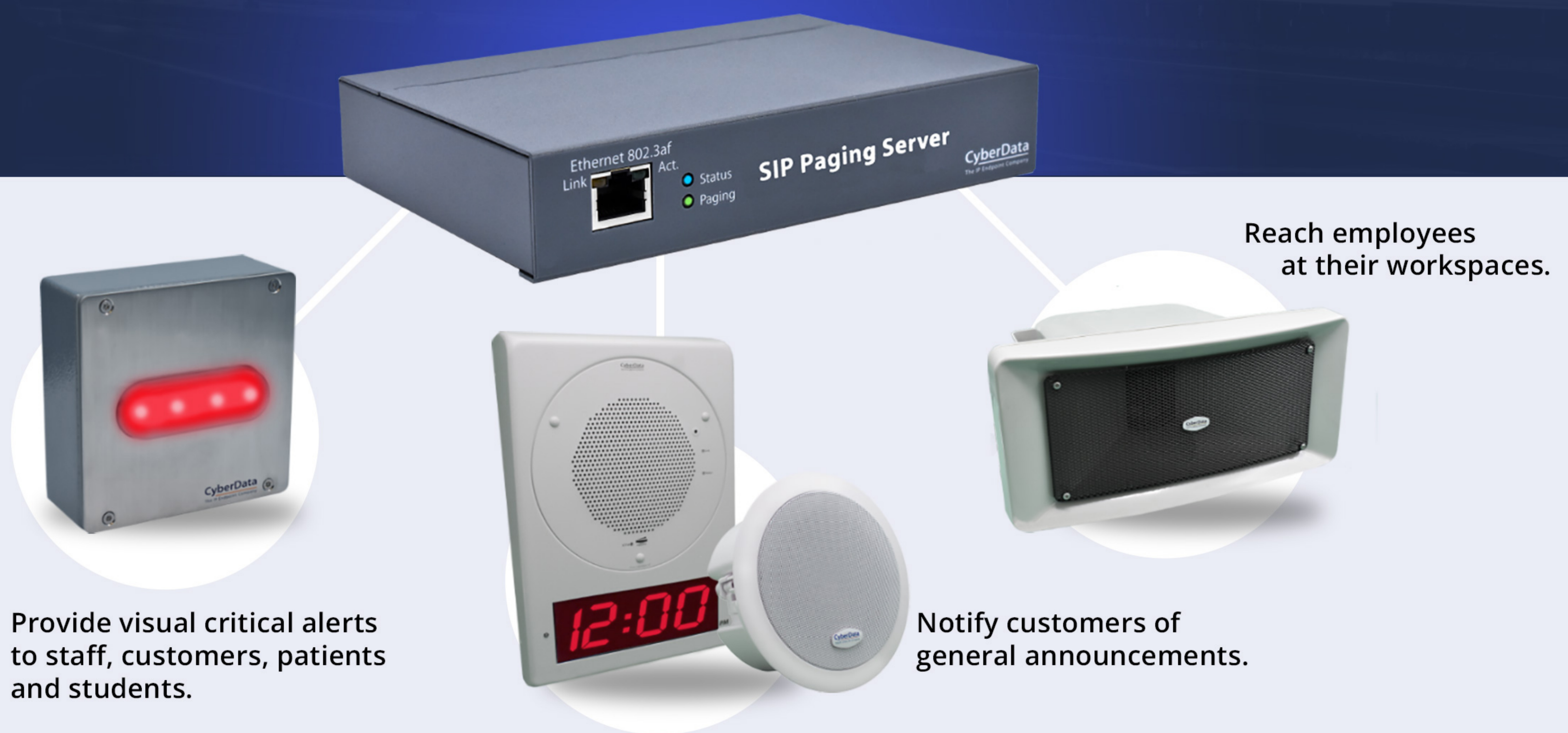
Provide visual critical alerts to staff, customers, patients and students.

With Regroup's Paging Server integration, our cloud-based mass notification platform couples with SIP endpoints and provides an easy-to-use solution for both on-site and remote teams.