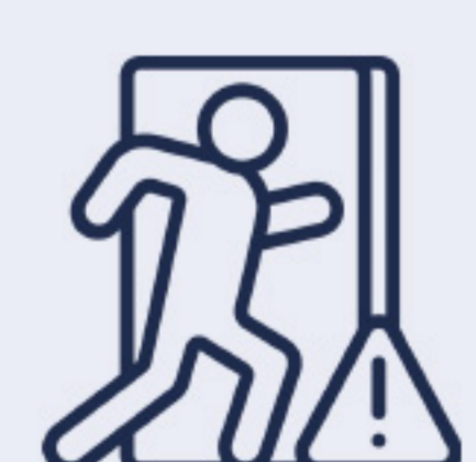
Drills and Training Exercises

Find out how you can deliver a more robust communication environment with simple, seamless hardware integrations from Regroup.